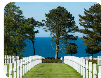
WWII Cemetery, Colleville-sur-Mer

the St. Therese of Lisieux Cathedral and reflect on the saint's legacy. Enjoy a meal featuring regional Normandy cuisine before spending the night in a comfortable hotel in Lisieux.