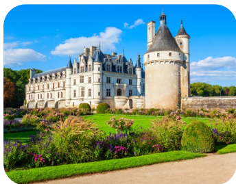
Château de Chenonceau